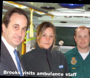
Brooks visits ambulance staff

Email: theoffice@braintreeconservatives.co.uk