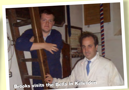
Brooks visits the Bells in Kelvedon