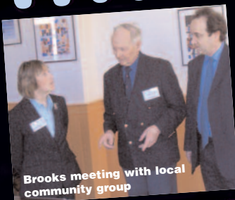
Brooks meeting with local community group