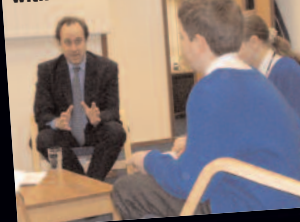
Brooks discusses local issues with school children